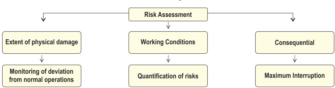
Flowchart 3: Elements of Risk Assessment