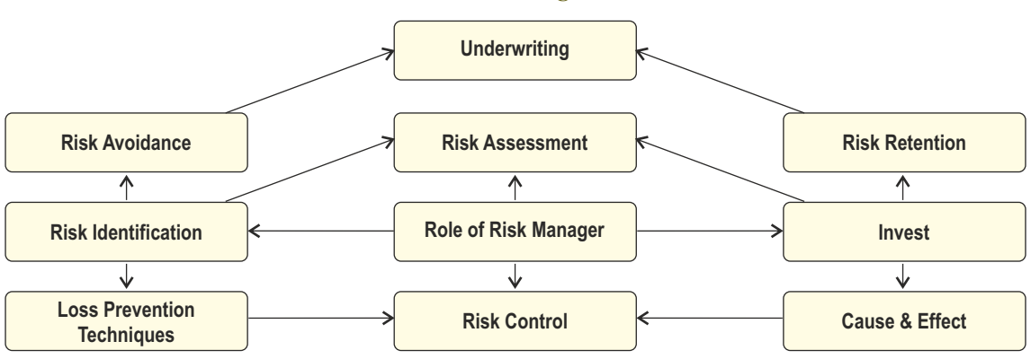
Flowchart1:Risk Management Process

Having discussed the mechanism of risk management, it is appropriate to consider the procedures of risk management that might be implemented to make it increasingly viable. Flowchart 1 below depicts the sequential elements of risk management that could be a solution to ease the problem of implementation.